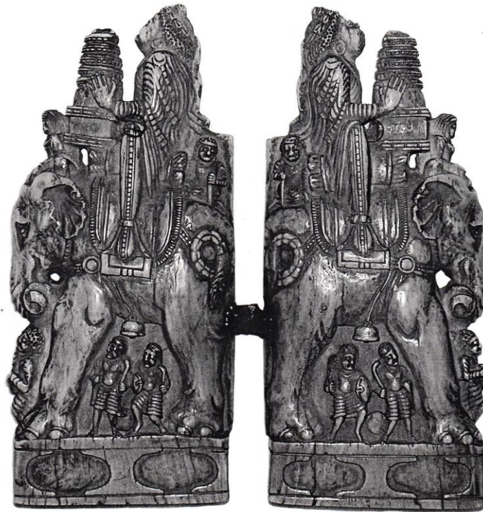
Figure 1. Exterior of the Ivory Diptych from National Museum of China, Beijing. No. 1952 ICL. Cat. No. 17, after Yoshihide 2000: 11.