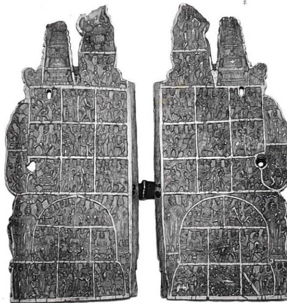
Figure 2. Interior Arrangement of the Ivory Diptych. Cat. No. 17, after Yoshihide 2000: 12.